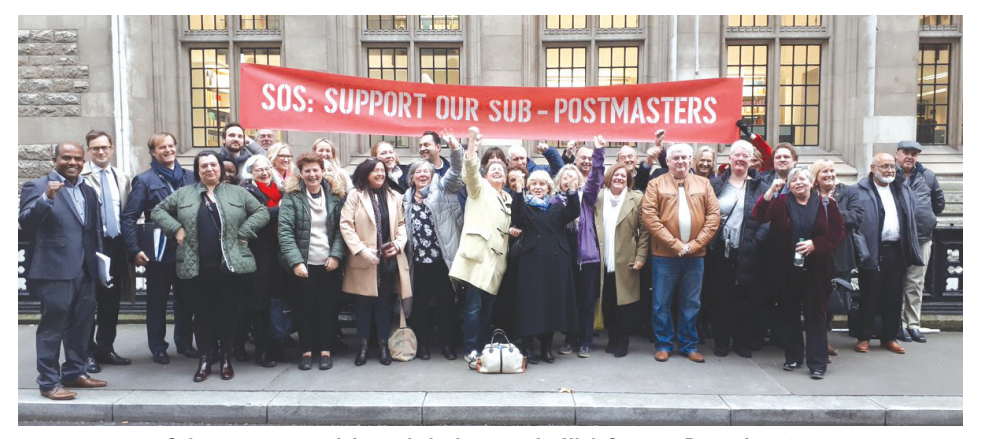
{\bf Sub-post masters\ celebrate\ their\ victory\ at\ the\ High\ Court,\ 16\ December\ 2019}

While the Post Office stands justly disgraced, there remains one shortfall larger than any thrown up by its IT system: that in accountability for those responsible for the scandal. If the lessons of one of Britain's worst abuses of official and corporate power are to be learned, it must be re-balanced.